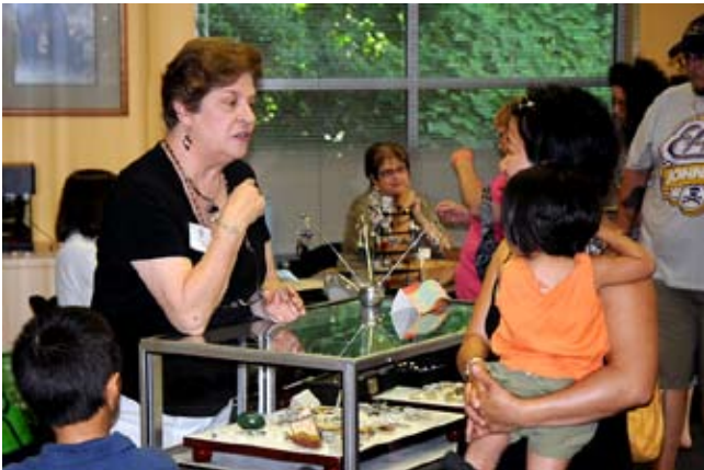
Rocks to Jewels

with a wide range of copper-silver earrings and a few mineral and rock samples for the kids. Scott, himself, spent most of the day doing geode cutting on the back deck and maintained a respectful quantity of mud on his arms, shirt and clothing. (More on that later.)