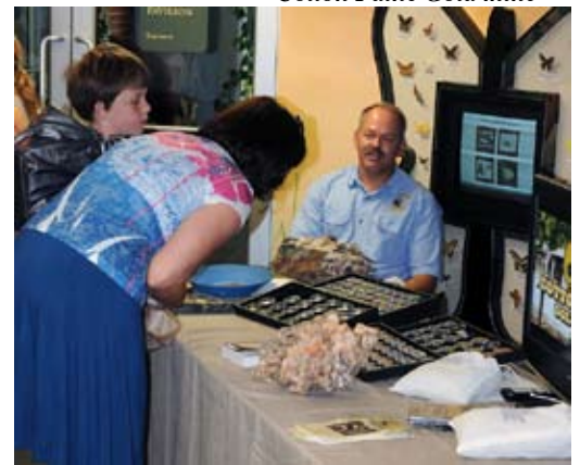
Cotton Patch Gold mine