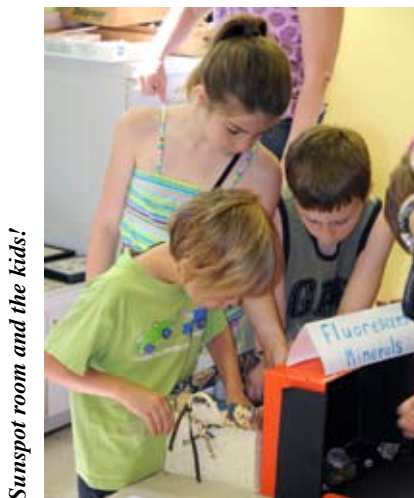
Sunspot room and the kids!