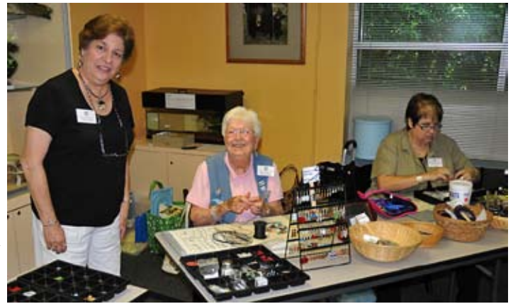
Craft & Jewelry Central