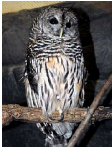
Museum Staff Watchman!

Just beyond the Sunspot room was the Naturalist Lab, or for this par-