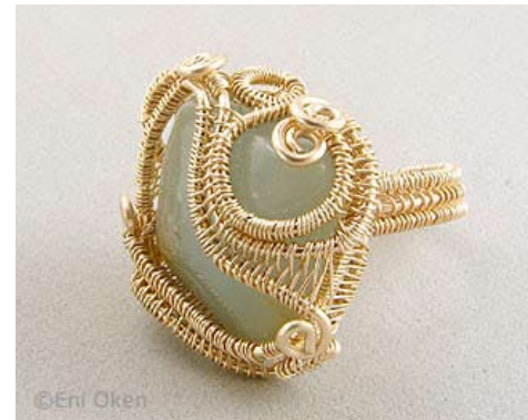
Oken's Rainbow Wrap