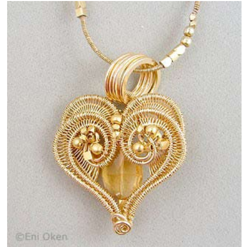
Oken's Woven Wrap