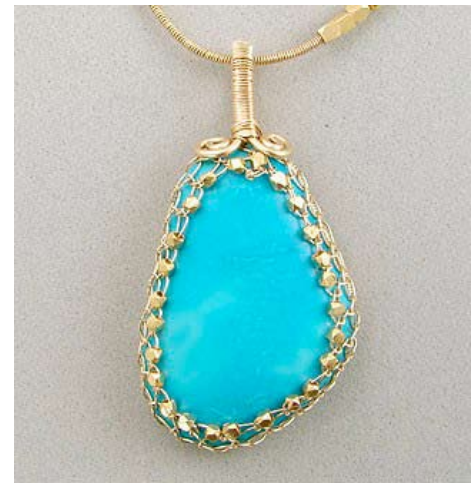
Oken's Net Wrap