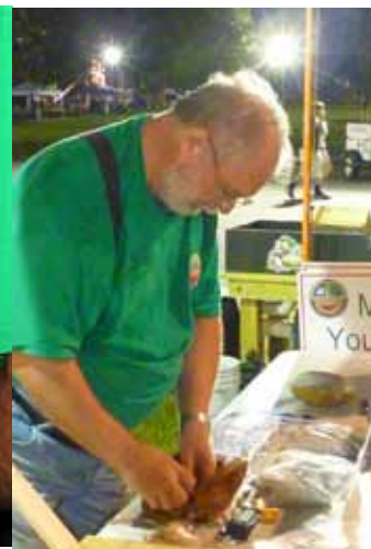
putting away the identification tools