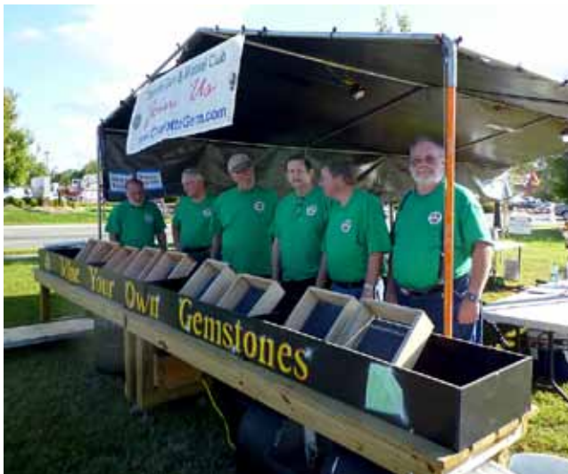
the green uniform of the day

We sold the smaller geodes and bags of goodies for our sluice, we divided up into cutters, assayers, sluice helpers, money takers, and a few wrappers. Depending on the time of day or night you might also be a “dumper” ... one who either helped keep the tent from becoming overloaded with water, or the sluice from becoming filled with gravel.