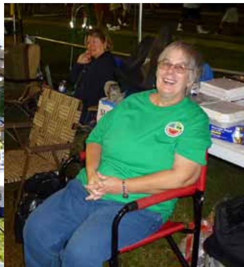
there was even room to sit and rest

We had a reasonably good weekend taking in about $1300 for our efforts. Not bad considering the amount of time it rained.