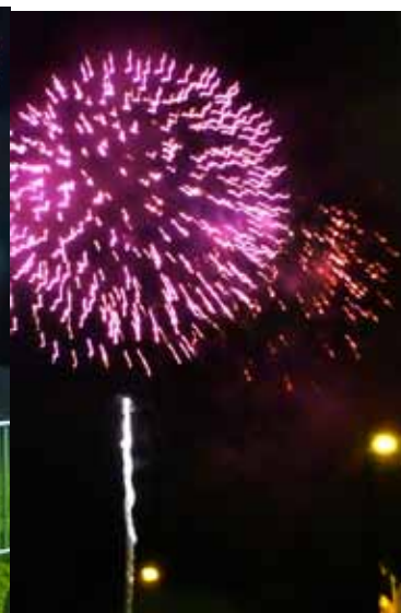
Mint Hill Madness ends a final bang!