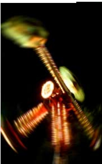
the area behind the city hall was teeming with rides and games