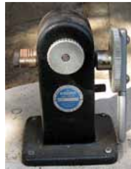
Kregan ring roller