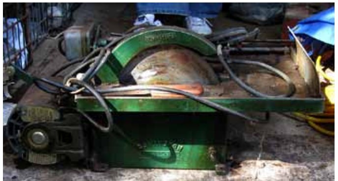
8" heavy duty trim saw