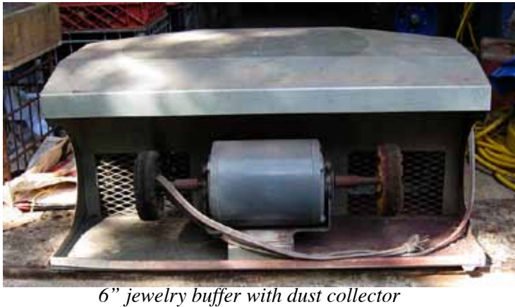
6" jewelry buffer with dust collector