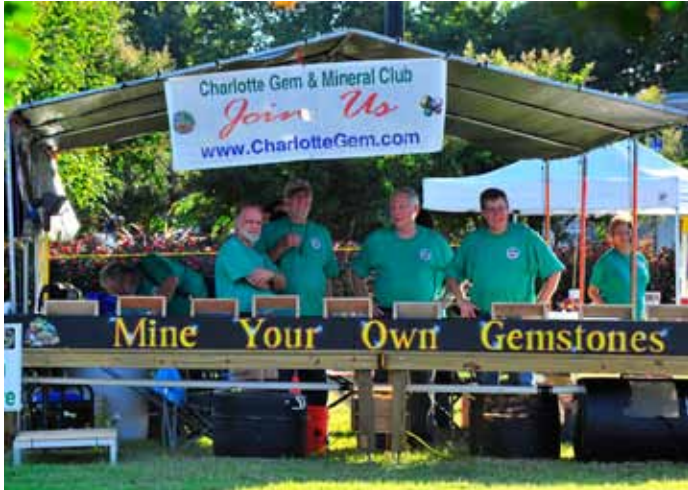
so this is what “home” looks like for the weekend

It was the best of times, it was the wettest of time. It was Mint Hill Madness as in, the real thing! We had sun, we had wind, we had water, we may have even had a bit of hail, and there was a little fun to boot. There was a parade with costumes, bands and even floats, there were carnival games and rides, and there were a the required vendors with “junk food”.