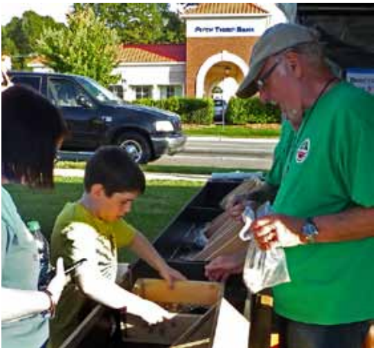
The sluice ran day and night (sometimes with a flashlight) -