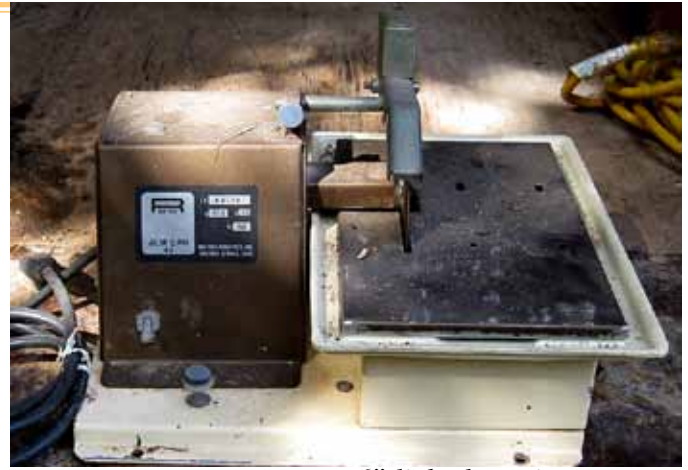
6" light duty trim saw

It's also time to download a copy of the "club point sheet" from the WEB site. Members earn points throughout the year by donating their time for various events (Matthews Live, Mint Hill Madness) or for providing food for a meeting, giving a presentation to the club, or just showing up at monthly meeting. Those who accumulate sufficient points are placed in an end of year drawing for a couple of week long scholarships to Wild Acres or William Holland. The totalled pints should be submitted by the end of the November meeting. The winners will be announced at the holiday party.