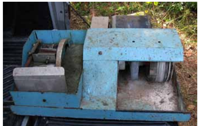
6" combo unit with saw, grinding wheel, expanding drum, and spin on polish disk.