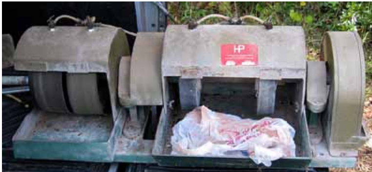
8" very heavy duty cabbing unit. room for two grinding wheels, and two side by side expanding drums - with end polisher