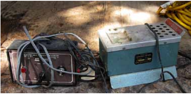
electric wax working carving tool & a cabochon dopping pot.