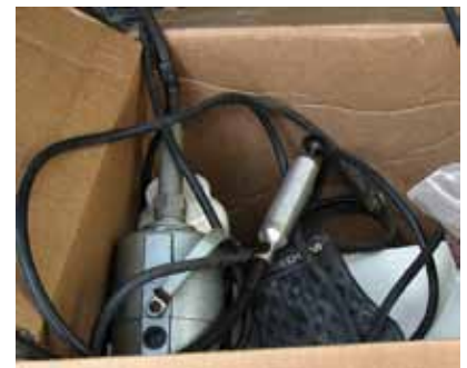
foredom motor tool