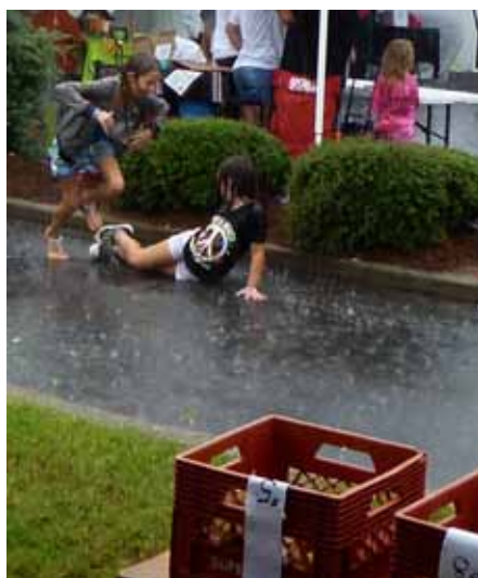
so what to do when it rains