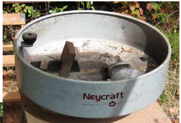
centrifugal casting machine for lost wax with extra parts