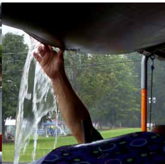
"dumper in action"