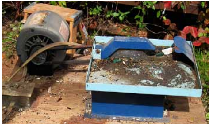
6" medium duty trim saw